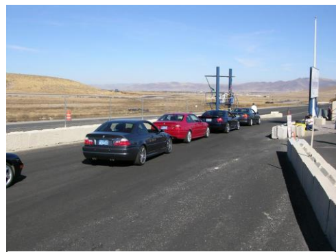
BMW's on the grid at Reno-Fernley Raceway during a track day

April 5/6 Training/Test & Tune PDX May 10 Event June 28 Event August 2/3 Driver's School August 30 Event September 20/21 Events October 18 Event