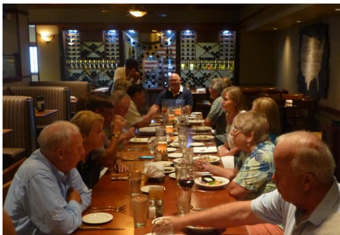
Dinner at C.R. Gibbs Steakhouse was delicious!