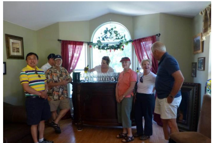
Enjoying the wine at Ringtail Vineyards!