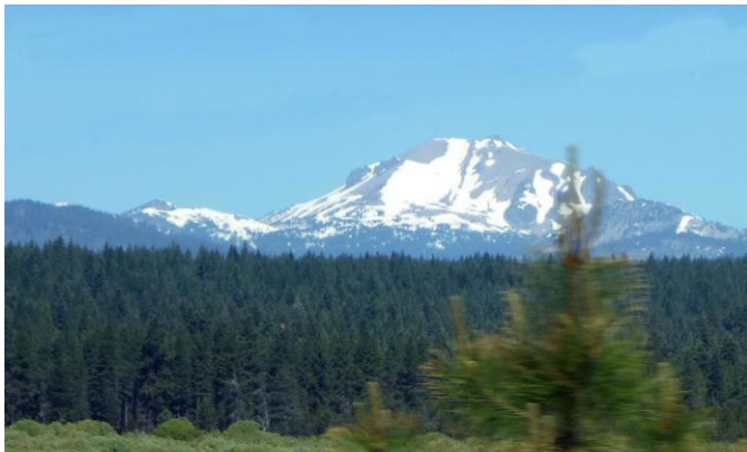
The view of Mt. Lassen was spectacular.