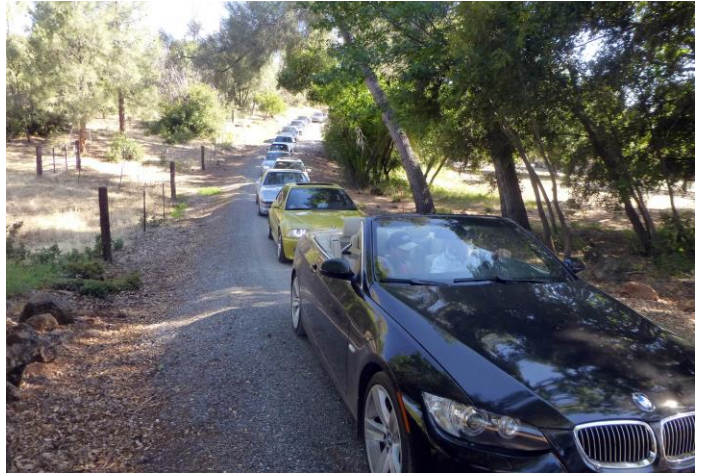
A nice collection of BMWs!

The tour included leisurely stops at four wineries, starting with Ringtail, where they had their picnic lunch. Shasta Daisy, Cedar Crest and Indian Peak followed, before heading to the Best Western Hilltop Inn in Redding overnight. Dinner was at C.R. Gibbs Steakhouse at the hotel. DeArmond Sharp won the Wine Knowledge quiz and a bottle of wine as the prize. The drive back Sunday morning was on-your-own, with several different routes possible. Total mileage driven – about 450 miles. Just perfect for BMW driving!!